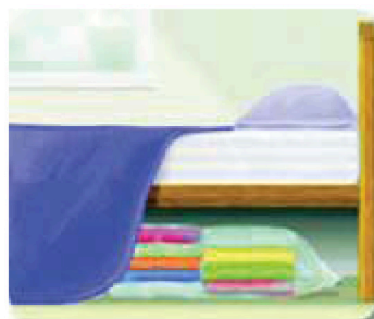
Storing Anywhere, Even in Small Places