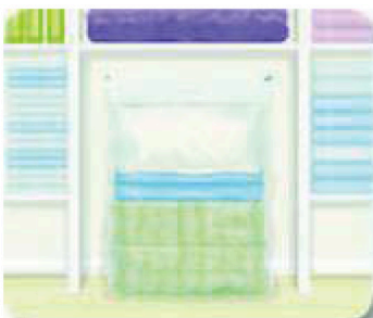
Protecting Linens and Clothing